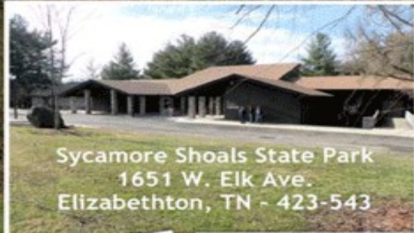
Sycamore Shoals State Park 1651 W. Elk Ave. Elizabethton, TN - 423-543

SECOND SUNDAY OF EVERY MONTH - 1:30-3:30P.M.