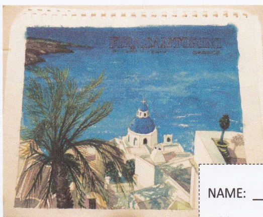
Plexi panel used on Artwork above while on location in Santorini, Greece. Total Paint time 2-1/2hrs.

have to be concerned about drawing correct perspective, shadows, models moving or a lot of measuring.