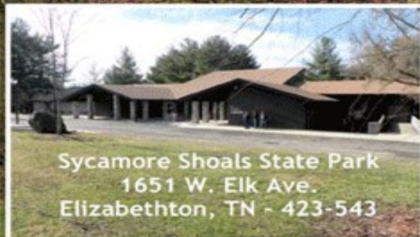
Sycamore Shoals State Park 1651 W. Elk Ave. Elizabethton, TN - 423-543

SECOND SUNDAY OF EVERY MONTH - 1:30-3:30P.M.